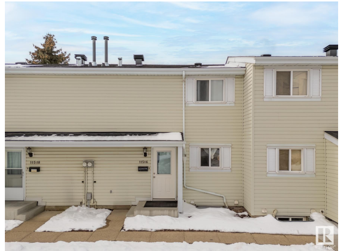
11516 139 Ave NW, Edmonton, AB